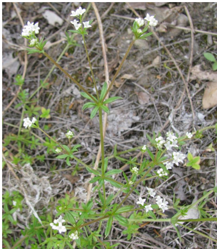
Fig. 9. Galium uliginosum L.

This species was found in Khentei by Dulamsuren and Muhlenberg (2003) in Khonin Nuga. Its location on Khuder is the second for this region. It is also listed for Khubsugul, Khangai, Mongolian Dauria, and Valley of Great Lakes (Grubov, 1982; Gubanov, 1996).