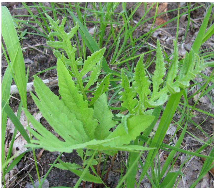
Fig. 2. Onoclea sensibilis L.

Previously, the family Onocleaceae was represented in Khentei by one species - Matteuccia struthiopteris (L.) Tod.: Honin Nuga (Dulamsuren and Muhlenberg, 2003), Khuder River valley (Kamelin and Dariymaa, 2004). The genus Onoclea L. is the second genus of this family, new for Mongolia. The species has a disjunctive distribution, its nearest location in Russia is in Priargunsk (Chita Province) (Danilov, 1988, 2000). It also occurs in East Asia and North America.