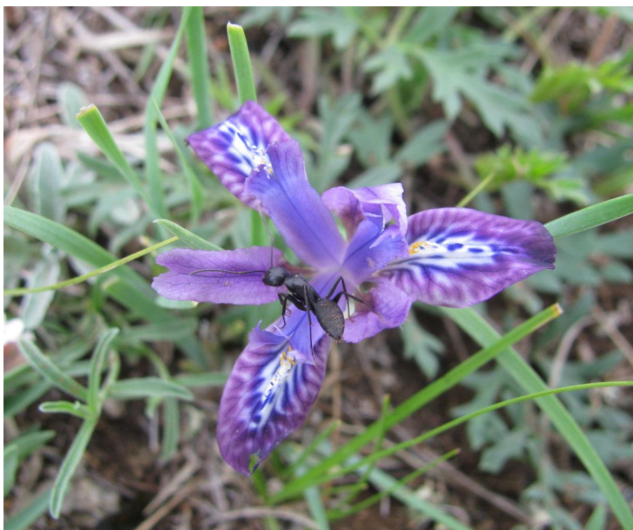
Fig. 4. Iris ivanovae Doronkin

* Iris ruthenica Ker-Gawl. subsp. brevituba (Maxim.) Doronkin, Fl. Sibir. (Arac.-Orchidac.): 121. 1987.