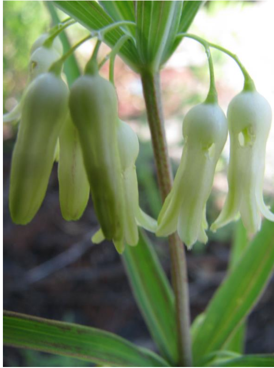
Fig. 3. Polygonatum sibiricum Redouté