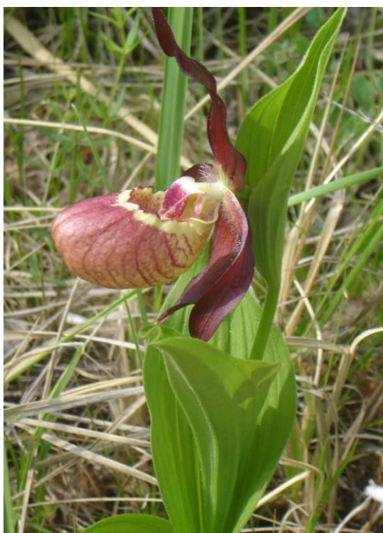
Fig. 5. Cypripedium ×ventricosum Sw.

The species has a hybrid origin ( C. calceolus L. × C. macranthon Sw.). It was reported for Northern Mongolia without specifying locations (Doronkin, 2003, 2007). The nearest location in Russia is in Buryatiya.