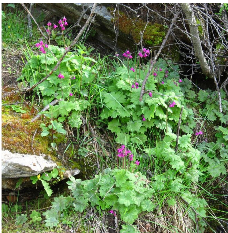
Fig. 7. Primula matthioli Richt. subsp. mongolica (Losinsk.) Kovt.

Listed from Mongolia as Cortusa altaica Losinsk. p.p. (Grubov, 1982; Gubanov, 1996). The genus Cortusa L. is included in the genus Primula L., sect. Cortusoides Balf. f., subsect. Cortusa (L.) Kovt., according to the current treatment (Kovtonyuk, 2011, 2013).