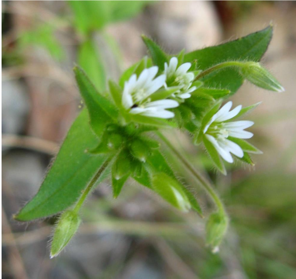
Fig. 6. Cerastium holosteoides Fr.

** Stellaria filicaulis Makino, Bot. Mag. (Tokyo) 15: 113. 1901.