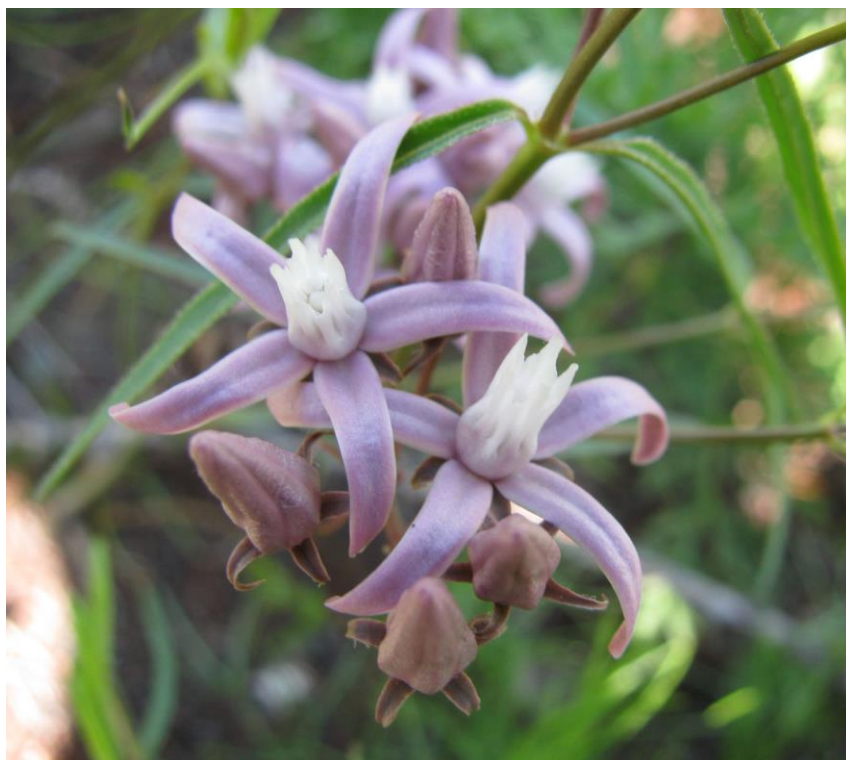
Fig. 8. Cynoactonum purpureum (Pall.) Pobed.

New for Khubsugul. Listed for Khentei, Mongolian Dauria, Great Khingan, Middle Khalkha and East Mongolia (Grubov, 1982; Gubanov, 1996).